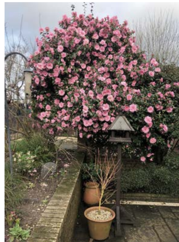
Timbercroft Close for Cardiac Rehab.