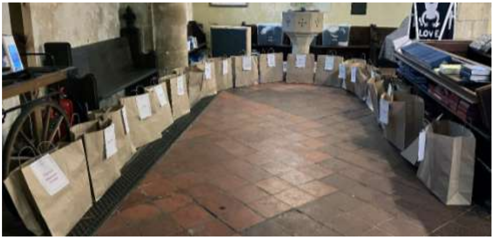
Donations for the Reverse Advent Calendar Froxfield and Privett Parish Information